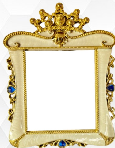
2009 7x9.75,8.25x12, 10.5x15.5"