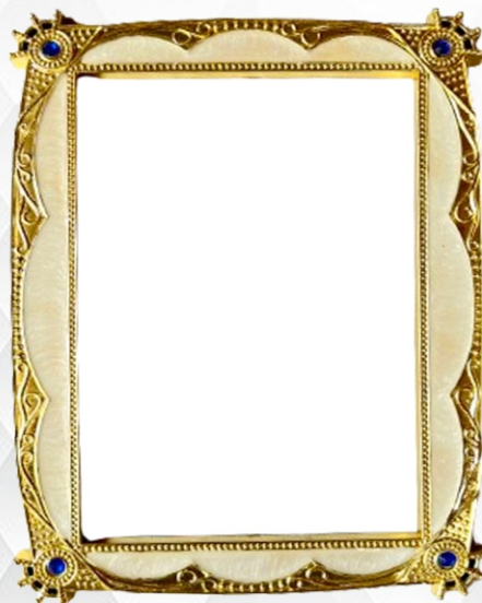
2018 8.5x7, 10x8.5, 10x11,"