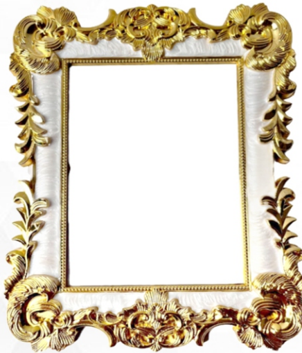
2033 7x9.25, 8x10.75, 11x14"