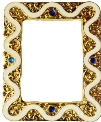
2015 8.5x7, 10x8.5, 10x11,"