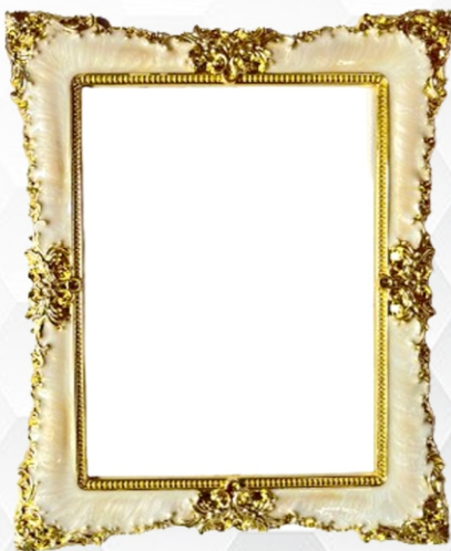
2017 8.5x7, 10x8.5, 10x11,"