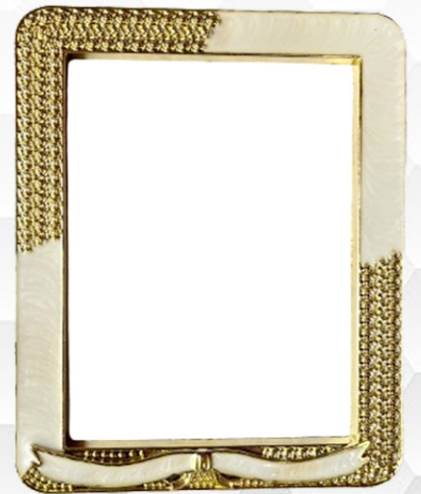
2019 8.5x7, 10x8.5, 10x11,"