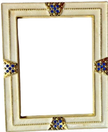
2014 8.5x7, 8.5x10, 4x10"