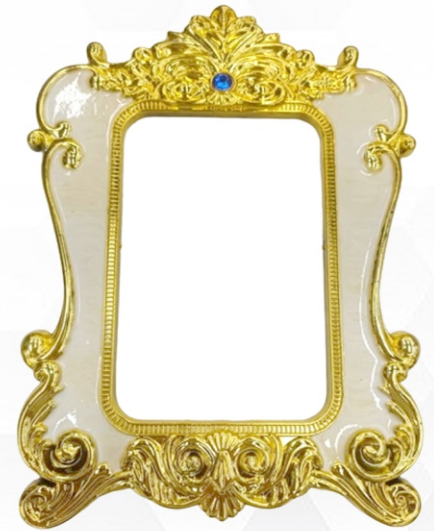
2034 8x10, 9x12.5, 11.5x15"