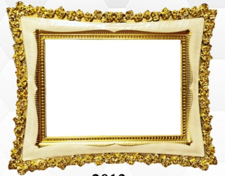
2013 7.75x8.75, 9.25x10.75, 11.75x13.75"