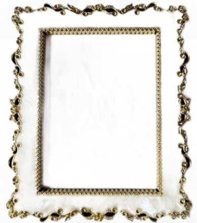
2016 8.5x7, 10x8.5, 10x11,"