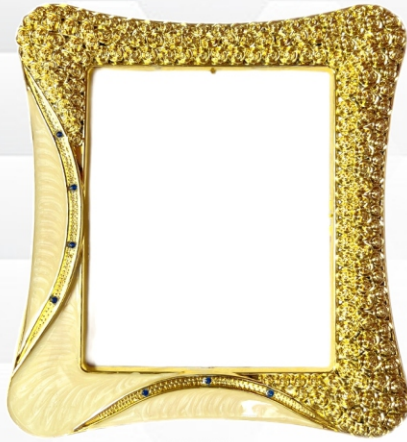
2012 8.5x7, 8.5x10.5, 11x13"